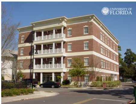
Classroom Building 105 (also known as CBD)