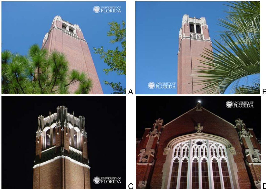
Figure 3-2. Series of University of Florida landmarks. A) taken from the base of Century Tower looking upward at 3:00 PM, B) taken from the northwest corner of the Music Building, C) taken from the CSE atrium at 9:00 PM and D) the University Auditorium. (Note: the caption in the list of figures does not include the sub-part descriptions).